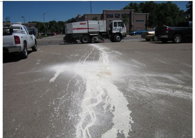
2011 Rock Cutting Slurry Spill on Main St, Mountain View Ave & Hover St

Please visit the IPP website: http://ci.longmont.co.us/pwwwu/ipp/permit.htm