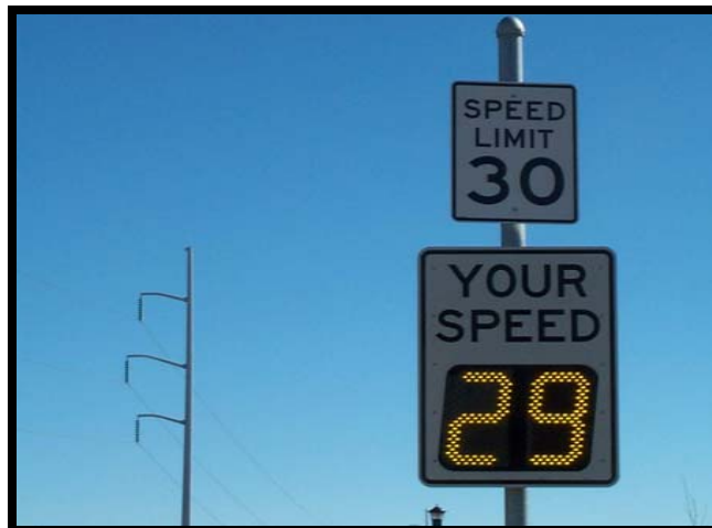
Device #3: Pole-Mounted Speed Display Unit