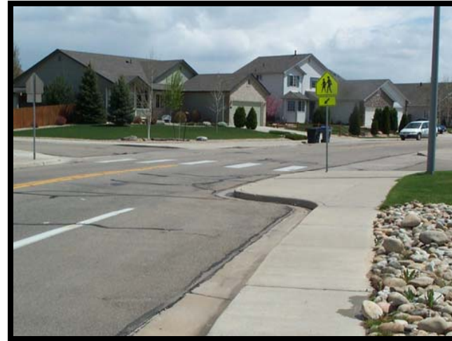
Device #2: Neckdowns