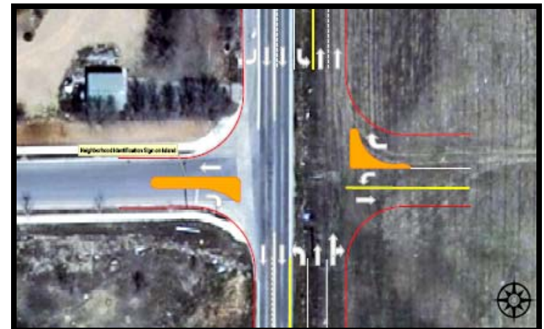
Device #5: Three-Quarter Movement