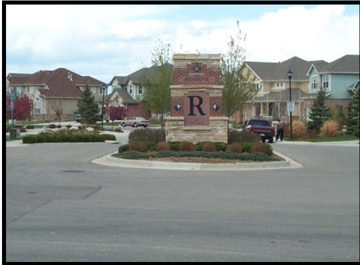
Device #1: Island with Neighborhood Identification Sign