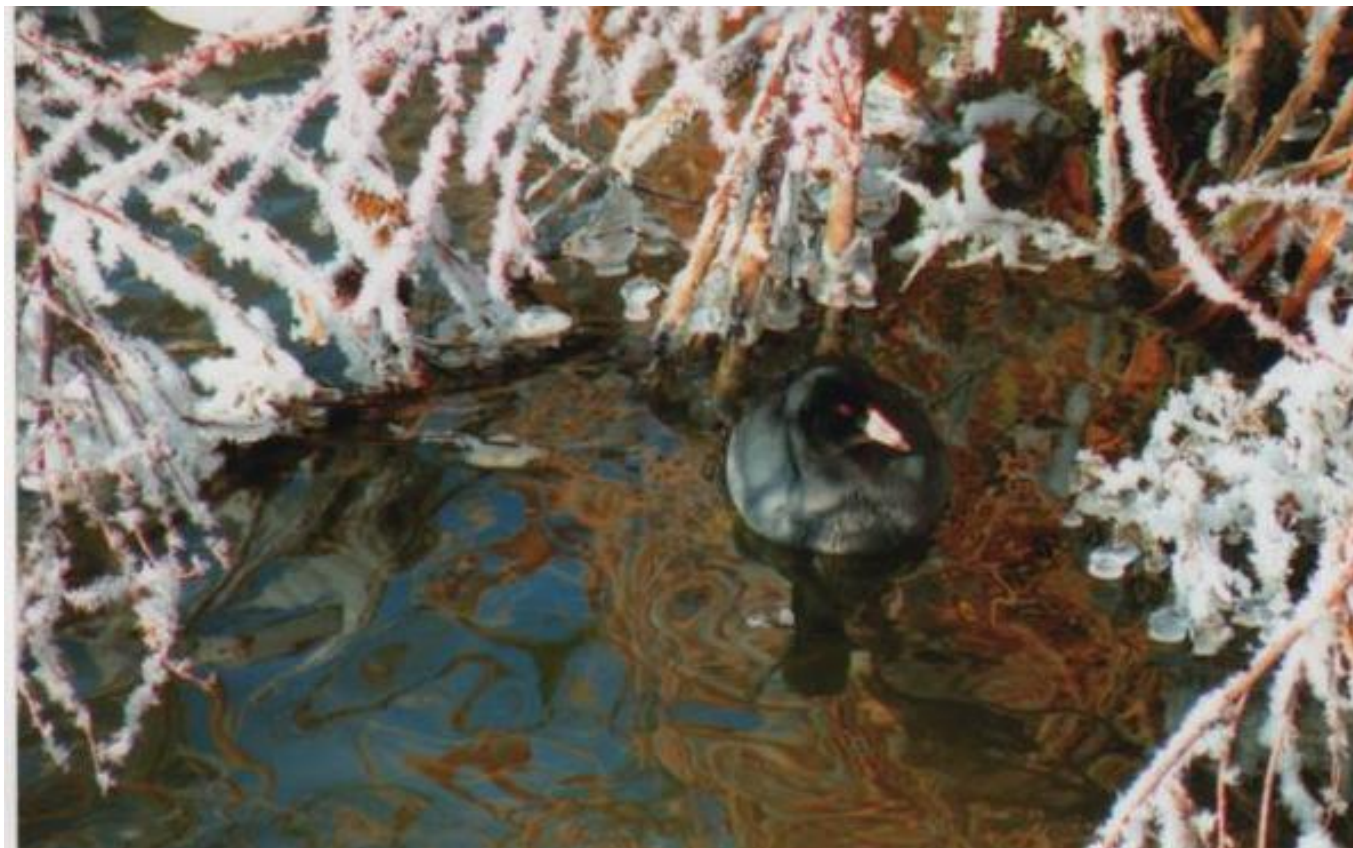
Surrounded by frosty grasses, a lone coot swims in the St. Vrain River.