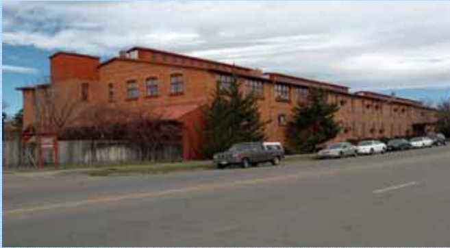
The Cannery "Warehouse Building"

The Cannery is an affordable housing complex consisting of three buildings with a total of 94 rental apartments. The "Warehouse Building" is a National Historic Landmark built in 1905. The Warehouse is a former cannery that was converted to multi-family housing in 1984. It is built of post and beam construction with a brick exterior. The Cannery West buildings were both built in 1984/85 with brick exteriors matching the Warehouse.