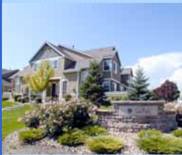
Sun Field Townhomes

The City of Longmont Affordable Homeownership Program is partnering with Habitat for Humanity, Thistle Community Housing, and our media partner, the Longmont Times-Call to hold the first ever Tour of Affordable Homes. The affordable home tour will provide the public an opportunity to learn about affordable homeownership and view affordable homes in Longmont.