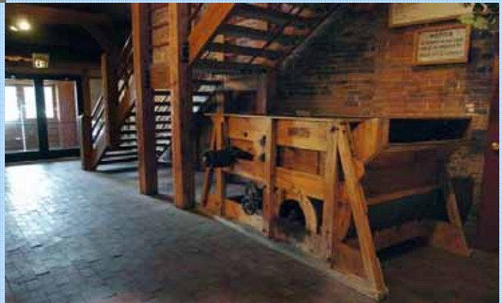
Artifacts of the past are located in the hall of the Warehouse

The Cannery is an affordable housing complex consisting of three buildings with a total of 94 rental apartments. The "Warehouse Building" is a National Historic Landmark built in 1905. The Warehouse is a former cannery that was converted to multi-family housing in 1984. It is built of post and beam construction with a brick exterior. The Cannery West buildings were both built in 1984/85 with brick exteriors matching the Warehouse.